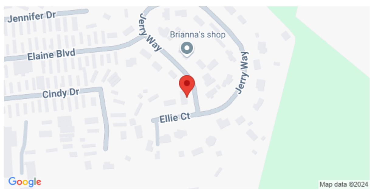
1126 Jerry Way, Summerville, 29486, SC