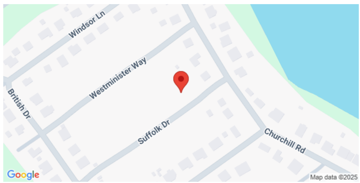
1613 Suffolk Drive, Moncks Corner, 29461, SC