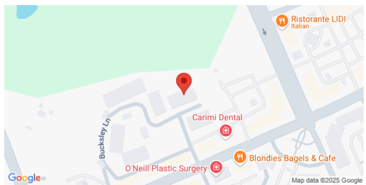
200 Bucksley Lane, Charleston, 29492, SC