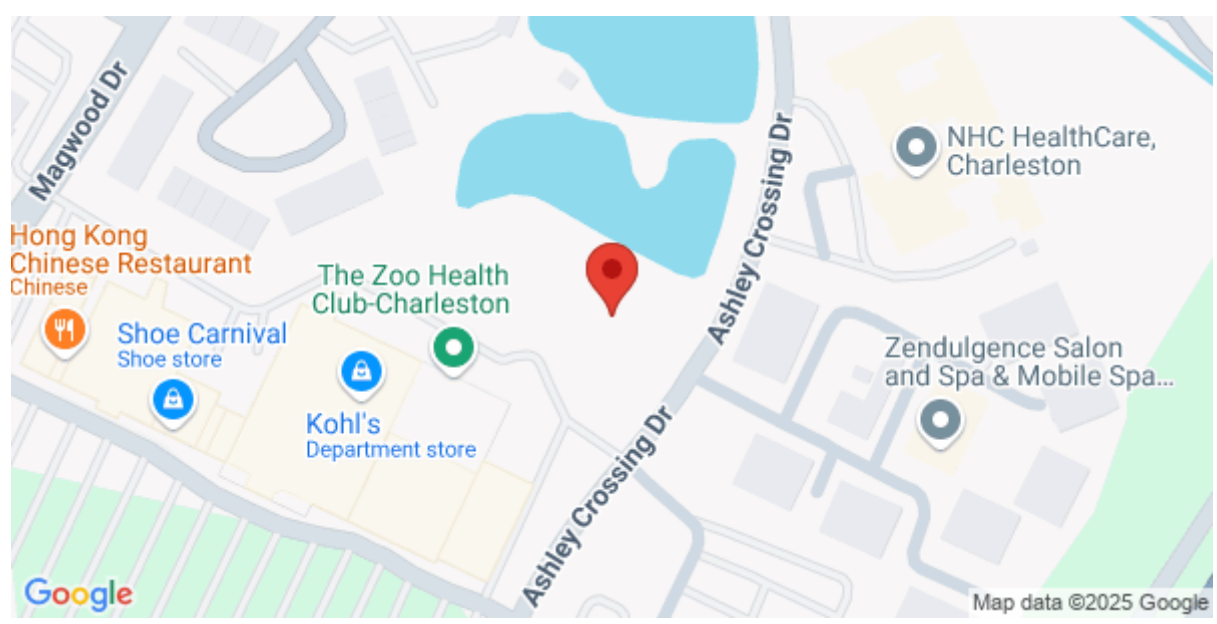
2241 Ashley Crossing Drive, Charleston, 29414, SC