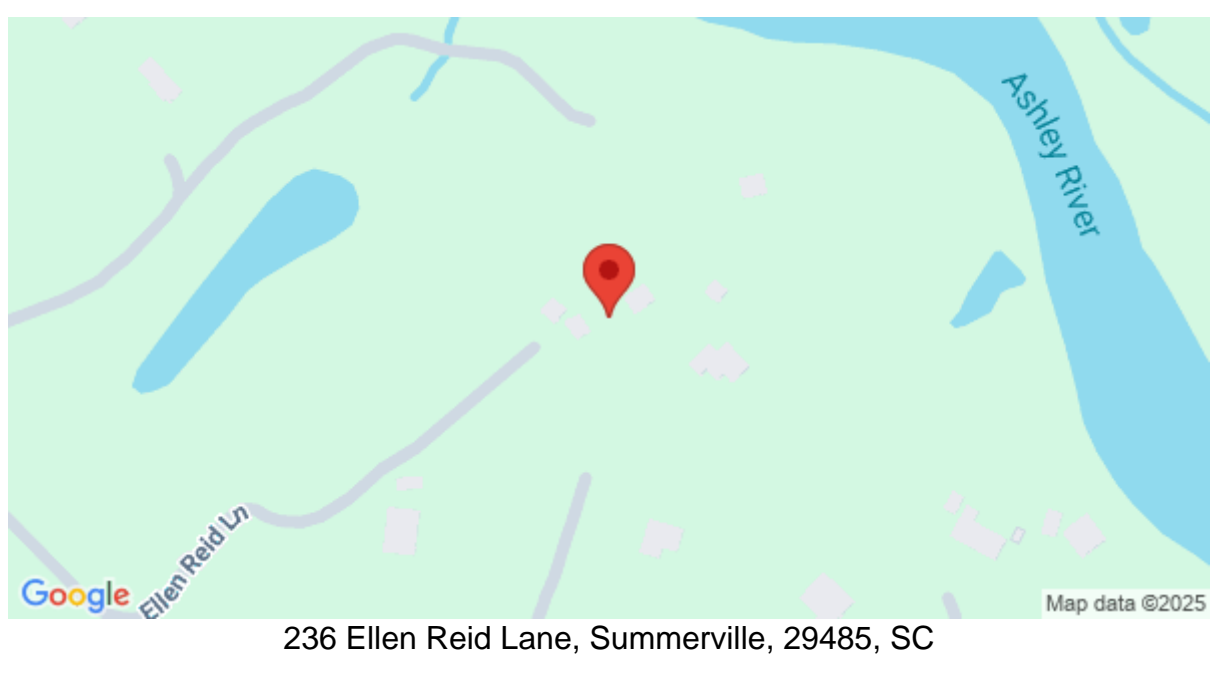
236 Ellen Reid Lane, Summerville, 29485, SC