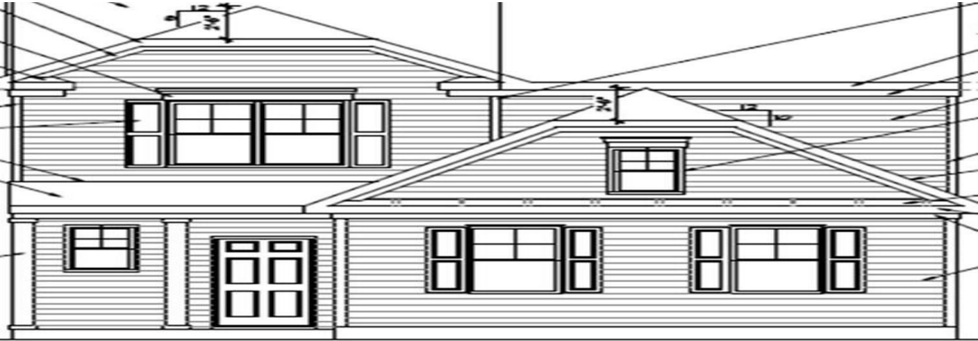
FRONT ELEVATION 'D' (SLAB) SIDE LOAD GARAGE SCALE: 1/4" = 1'-0" ON 22034, 1/8" = 1'-0" ON 1117

https://greathomesofcharleston.com/properties/2838-otranto-road/north-charleston/sc/29406/MLS_ID_25006210