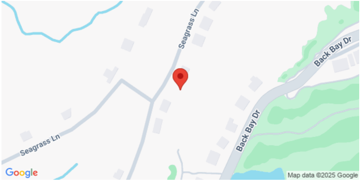
3 Seagrass Lane, Isle of Palms, 29451, SC