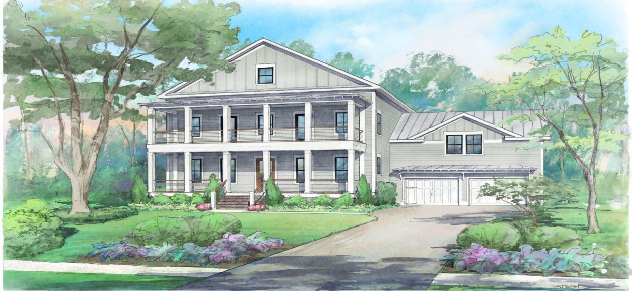
3845 DELINGER DR

https://greathomesofcharleston.com/properties/3845-delinger-drive/mount-pleasant/sc/29466/MLS_ID_25006391