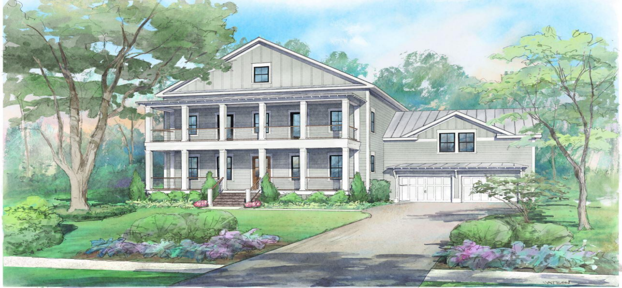
3845 DELINGER DR

https://greathomesofcharleston.com/properties/3845-delinger-drive/mount-pleasant/sc/29466/MLS_ID_25006391