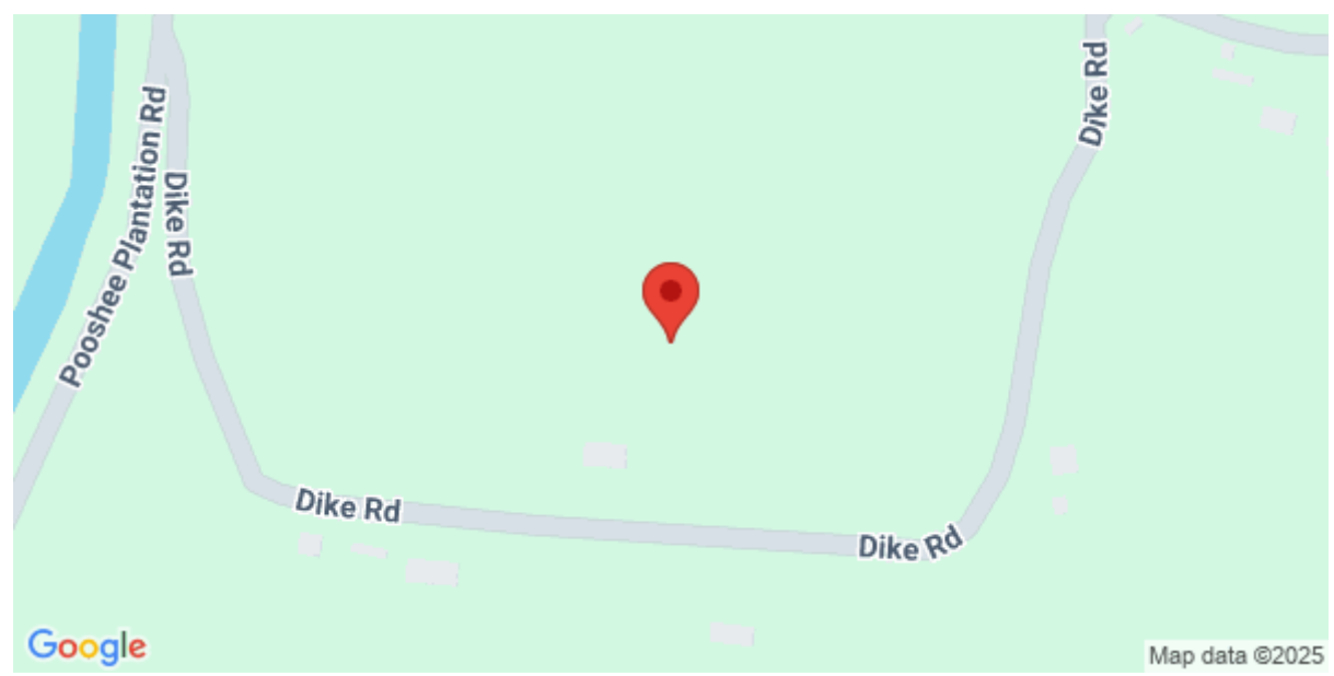
390 Dike Road, Bonneau, 29431, SC