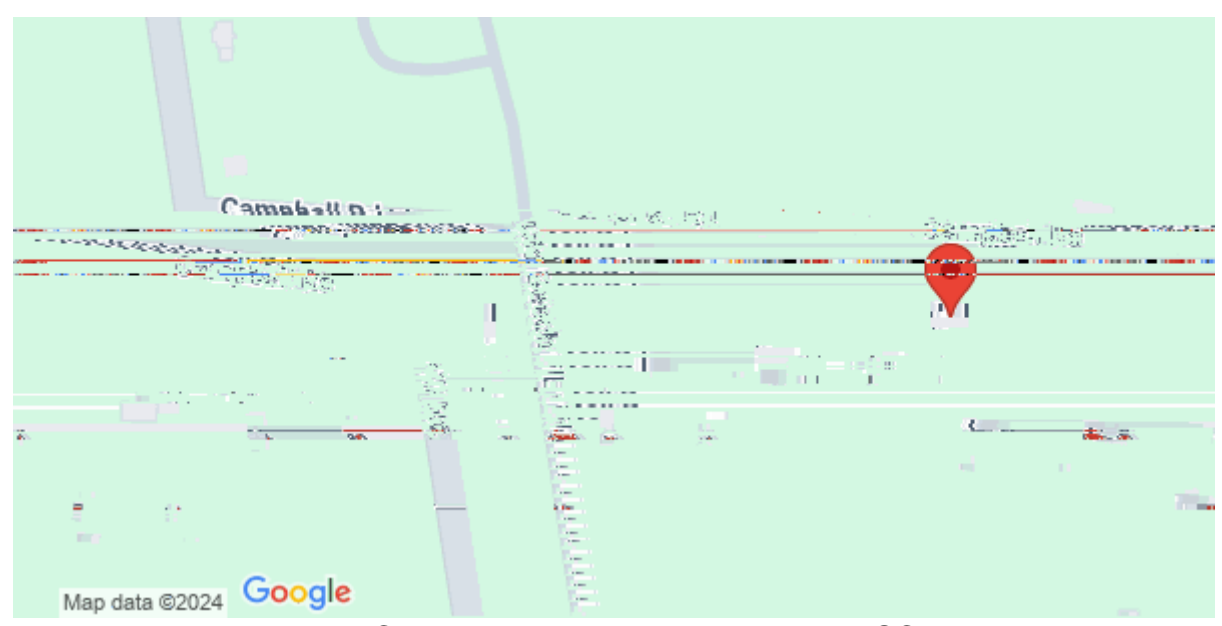
683 Campbell Road, Ridgeville, 29472, SC