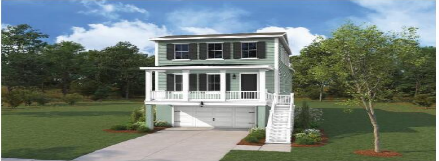
ELEVATION C ✓

https://greathomesofcharleston.com/properties/712-minton-road/james-island/sc/29412/MLS_ID_25007608