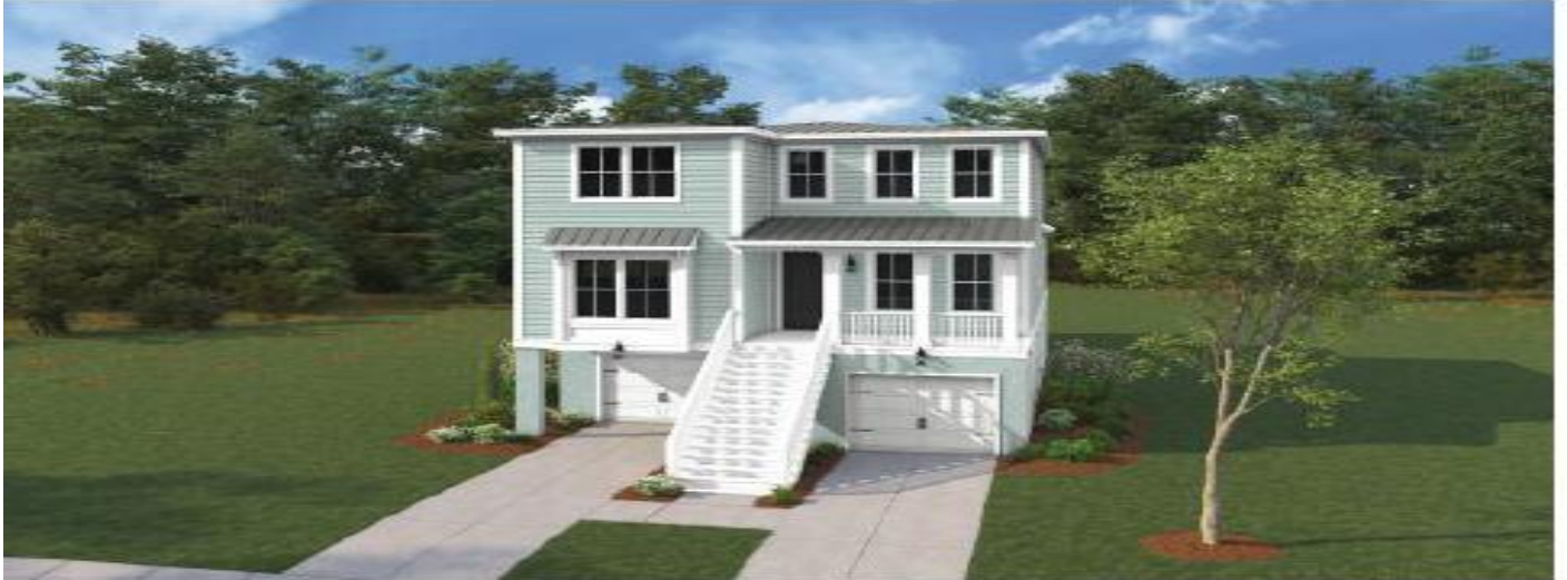
ELEVATION E ✓

https://greathomesofcharleston.com/properties/718-minton-road/charleston/sc/29412/MLS_ID_25007656