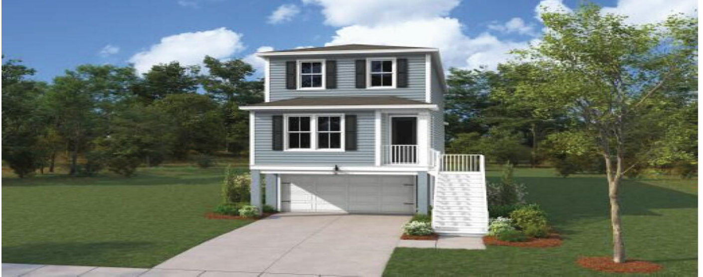
ELEVATION A ✓

https://greathomesofcharleston.com/properties/724-minton-road/charleston/sc/29412/MLS_ID_25007666