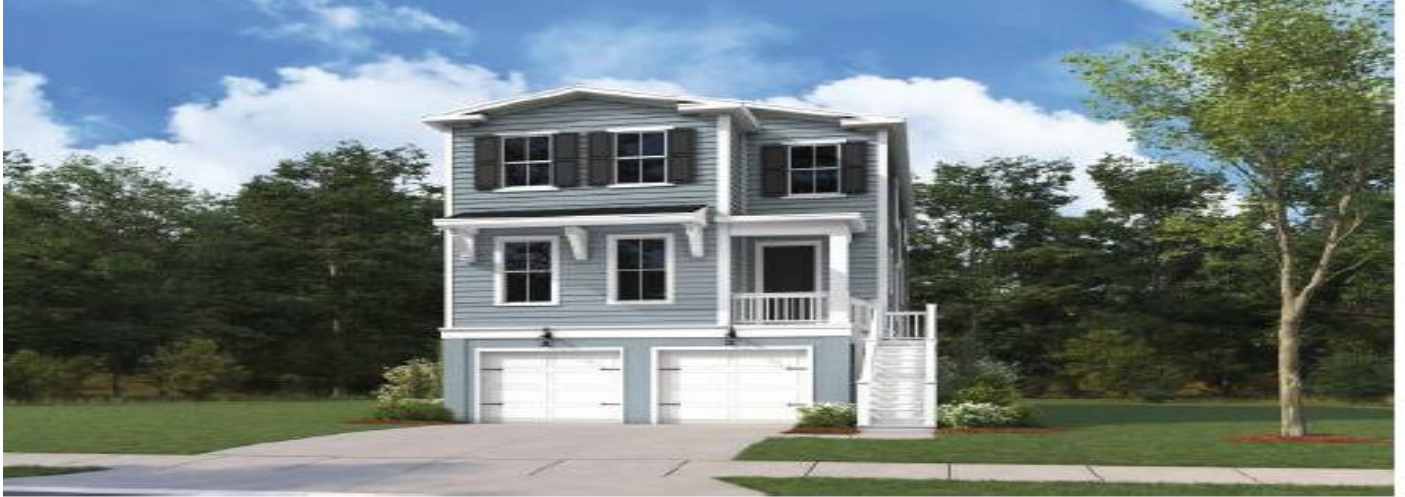
ELEVATION B ✓

https://greathomesofcharleston.com/properties/744-minton-road/charleston/sc/29412/MLS_ID_25007724