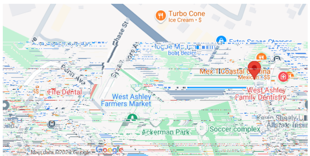
83 Avondale Avenue, Charleston, 29407, SC