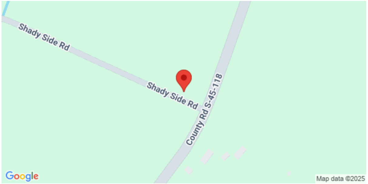
Shady Side Road, Hemingway, 29554, SC