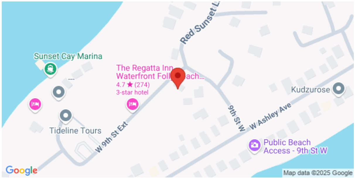
Street, Folly Beach, 29439, SC